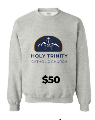
Sweatshirt Grey (S/M/L)